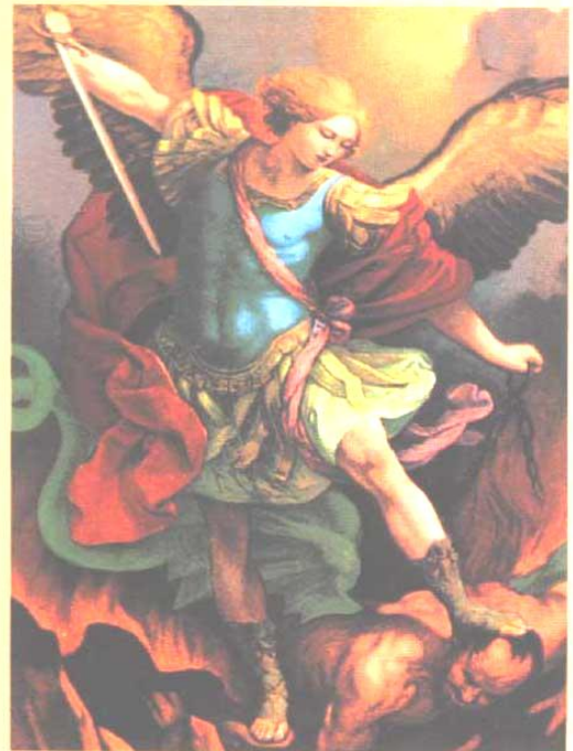
ST. MICHAEL THE ARCHANGEL Pray for us.